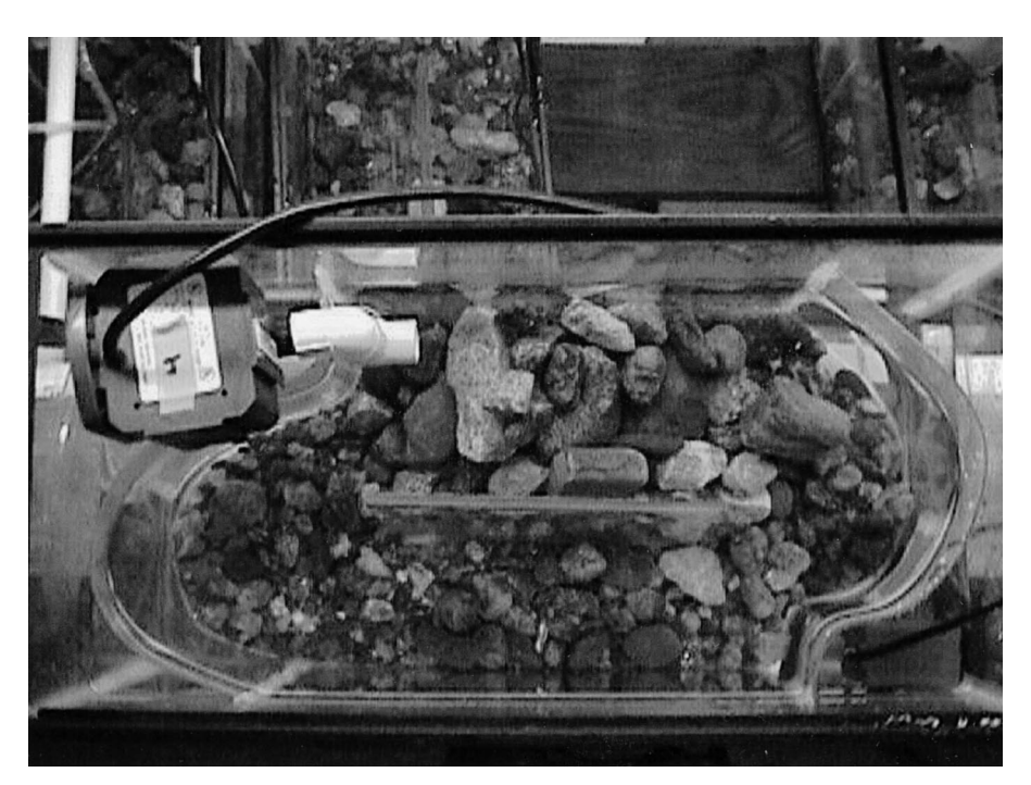
FIGURE 1.—Top view of aquarium modified to simulate pulsed, high-velocity water (>35 cm/s) and stable, low-velocity water (<10 cm/s). Water pumps were placed in squared pockets to prevent the eggs and larvae from being sucked into the water intakes.

to the water level in the aquaria, and a 1-hp water chiller was used to maintain a constant temperature. Three 100-W fluorescent grow lights were hung overhead to ensure equal light intensity, and timers were used to maintain a natural photoperiod. Gravel substrate similar in size, shape, and composition to that at spawning sites was collected from nearby rivers and placed in the aquaria to a depth of 2–5 cm. Additional spawning substrate was used to create nests 5–10 cm deep on one side of the channel divider in each aquarium.